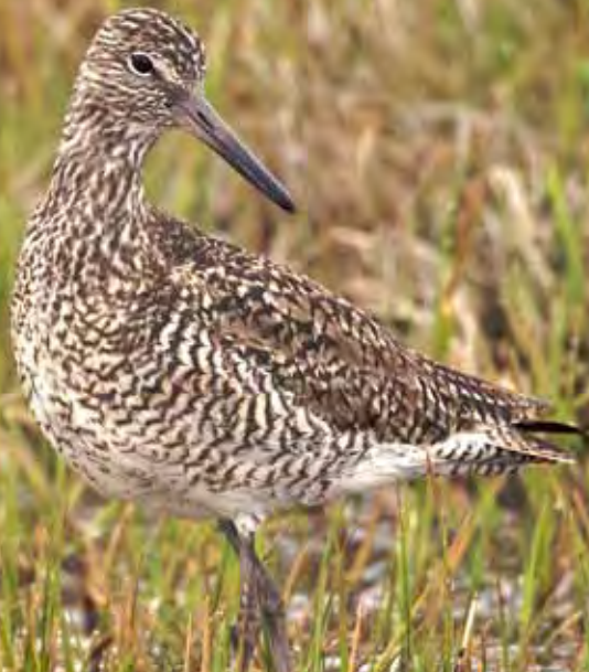
Teta'kumiki Willet - Tringa semipalmata