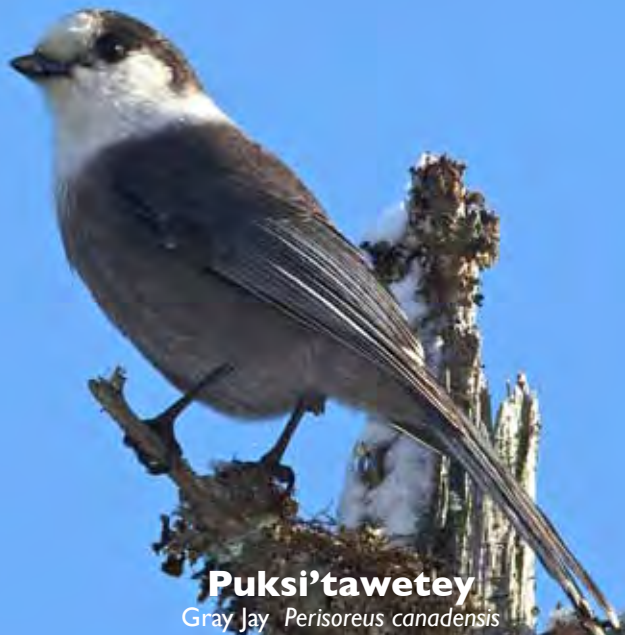
Puksi'tawetey Gray Jay Perisoreus canadensis