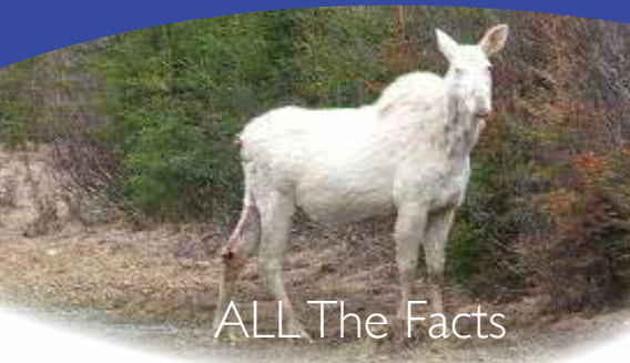
ALL The Facts