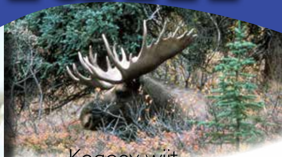
Koqoey wjit weji-ksalu'kik

Netuklimkik Tia'muk na ajelk wesku'tasik aqq pasik Tia'm. Weskumu'kik na kikmanaq wutank.