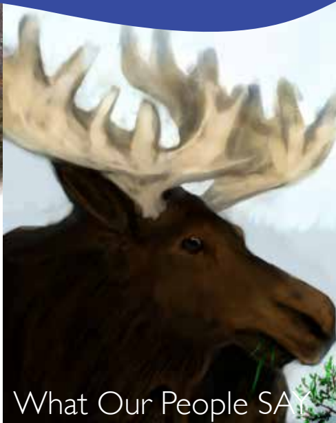
What Our People SAY