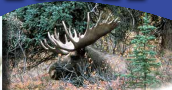
WHY We Love Them

Traditional Tiam harvesting is about more than just Moose. It's about community.